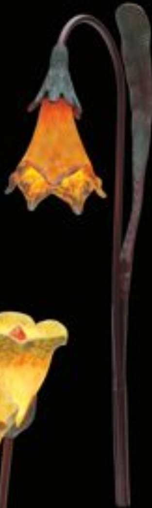
Star Lily Sunset