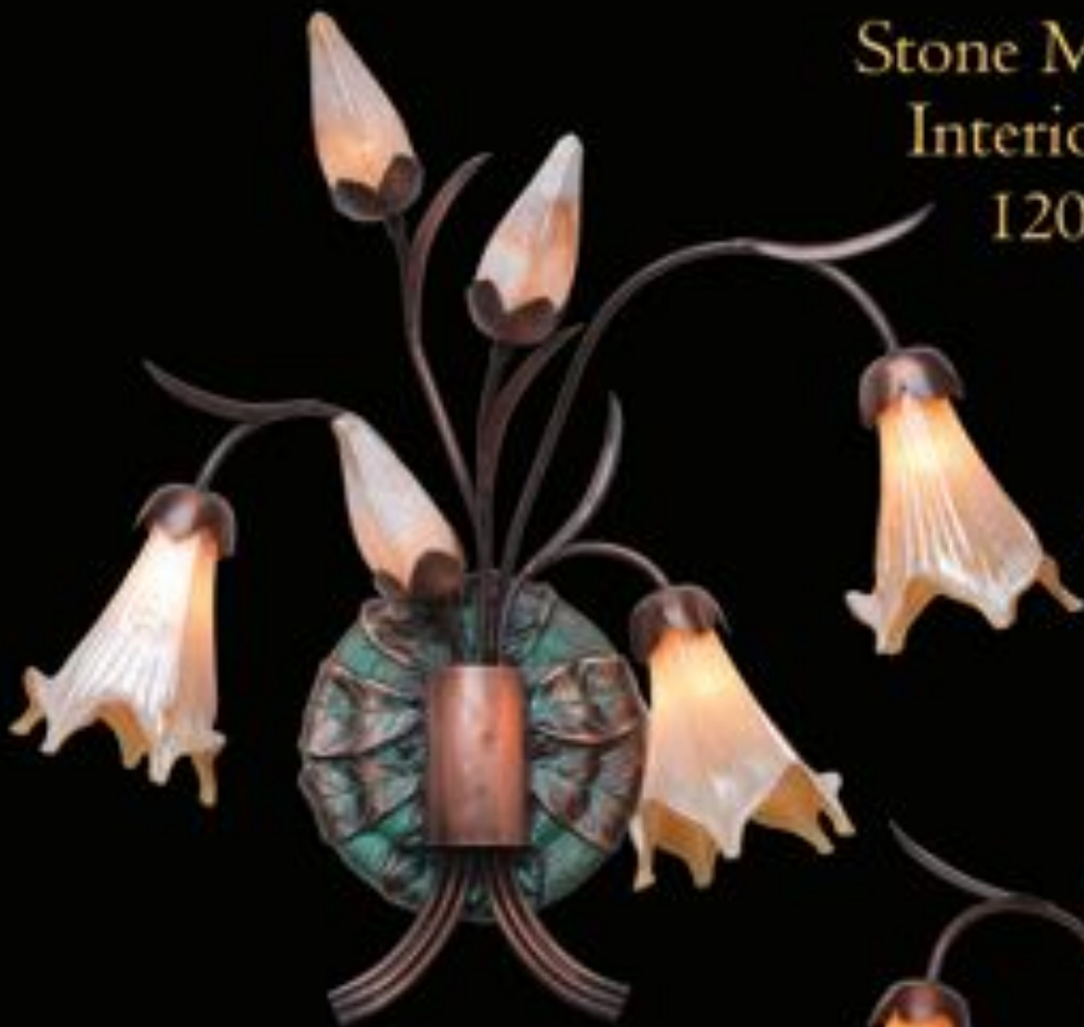
6 Light Star Lily Sconce