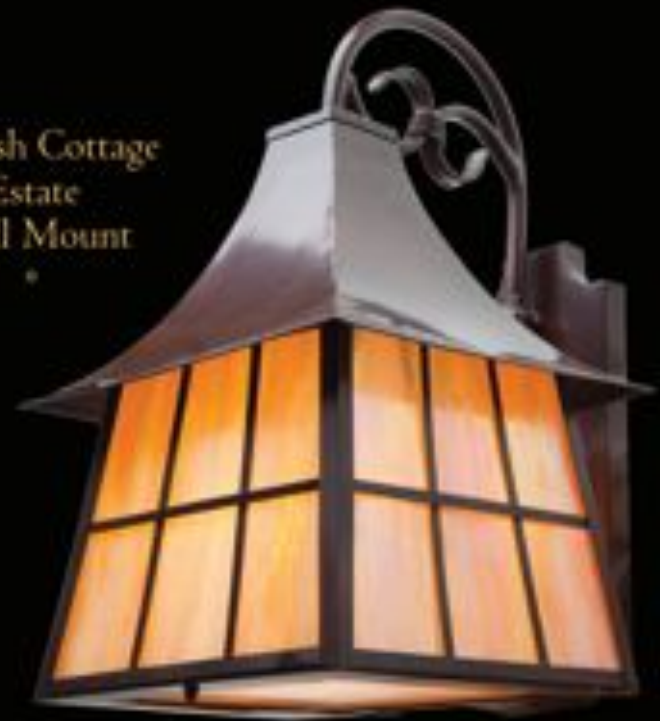
English Cottage Estate Wall Mount