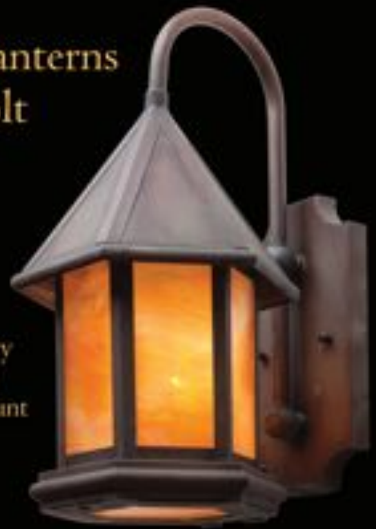
Canterbury Porch Wall Mount