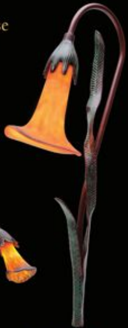
Calla Lily Sunset