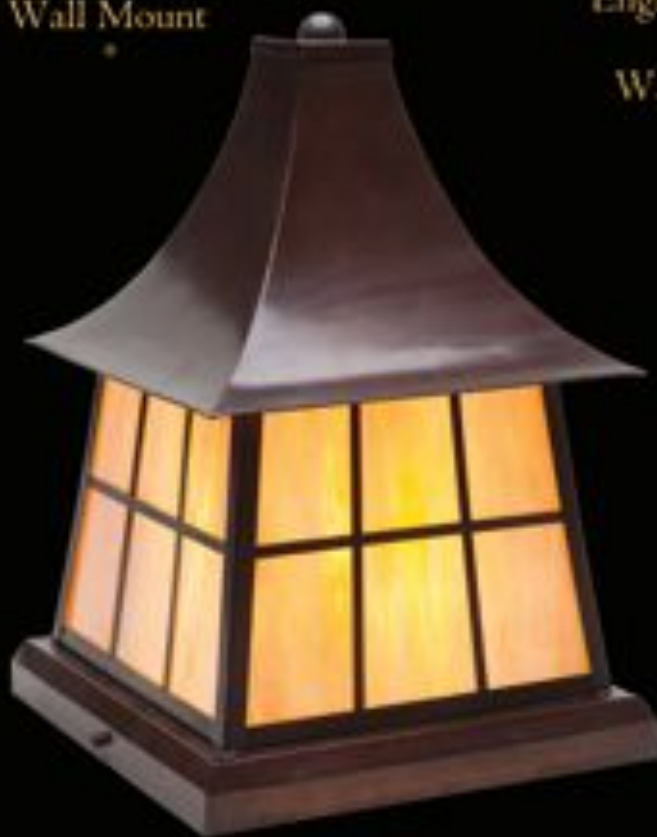
English Cottage Estate Pilaster