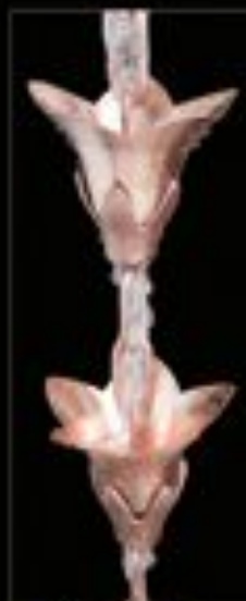
Rain Chain Royal Lotus