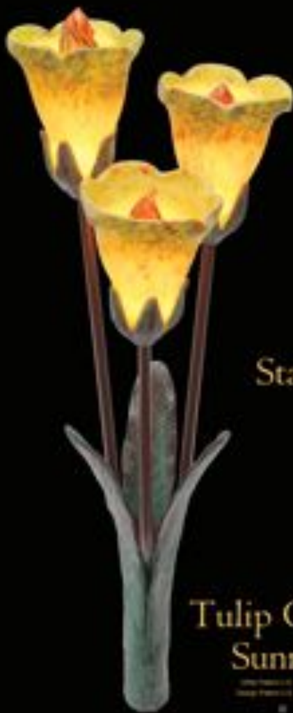
Tulip Cluster Sunrise