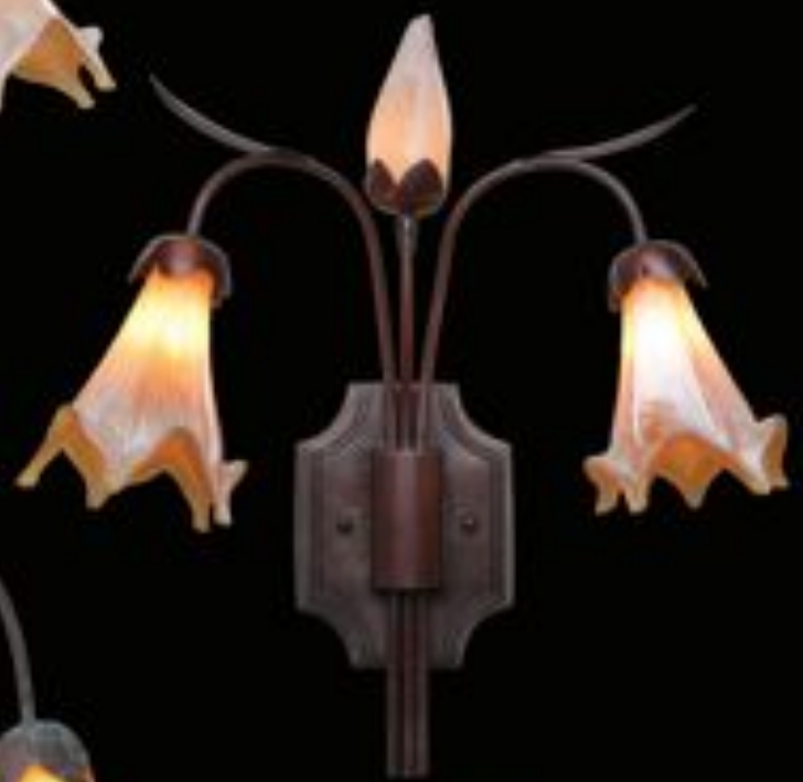
3 Light Star Lily Sconce