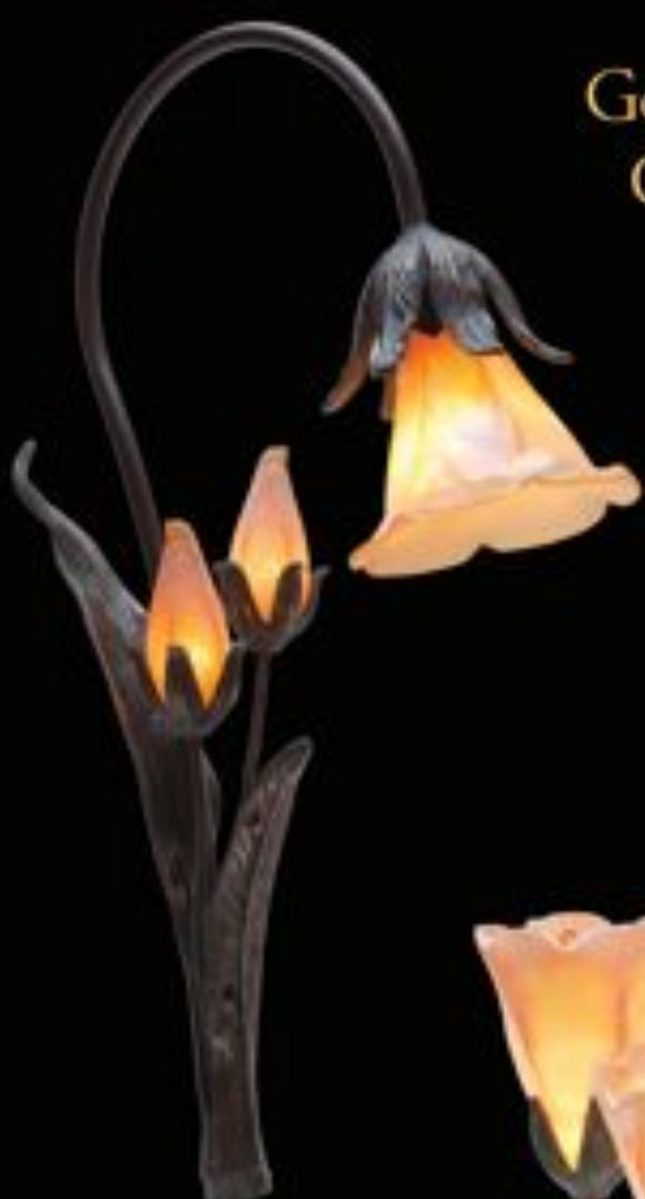
Royal Evening Primrose

Only available in the US Design Patent # 6,100,000