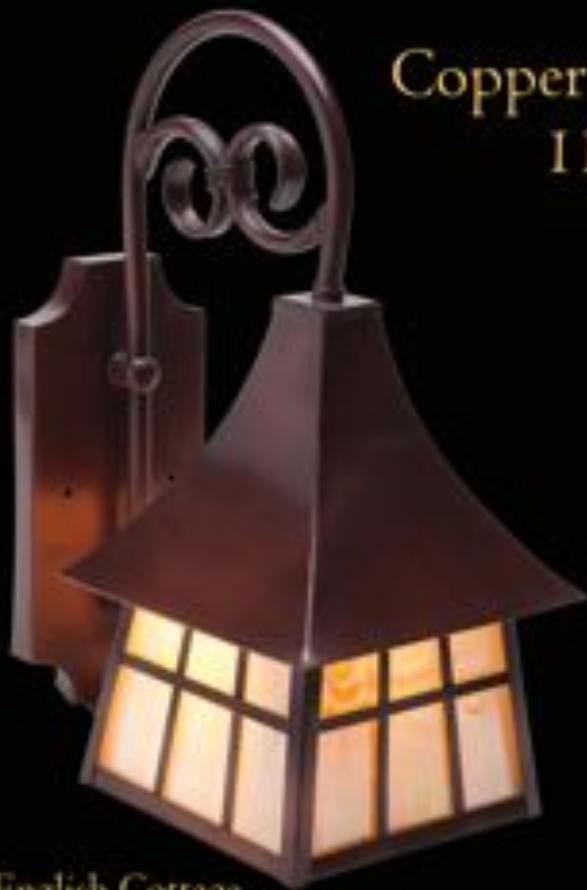
English Cottage Porch Wall Mount