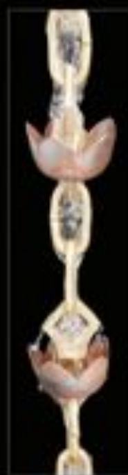
Rain Chain Lotus