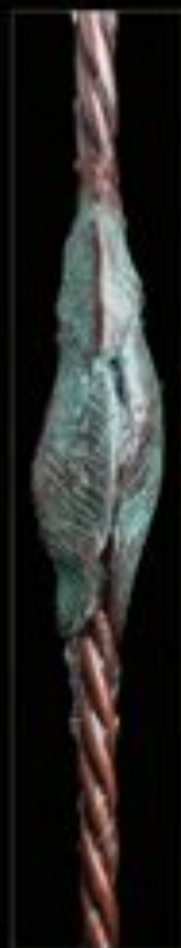
Rain Chain Twisted Vine